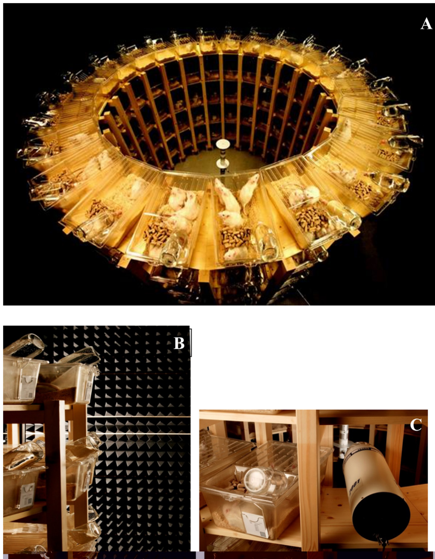
Fig. 1. RI study on 1.8 GHz base station RFR: exposure system. The rat cages were located in wooden circular-shaped devices, as in a sort of condominium. Each single exposure device served at least 400 rats (A). The exposure rooms were totally shielded in order to minimize the effect of field non-uniformity due to reflection and consequent interference caused by the walls (B). Detail of the RFR feedback probe used to measure the field (TESY2001 field sensor) and of the animal cage with methacrylate markers, cover and mangers (C).

produce the following functions: a) generate a GSM signal, with complete channel simulation capability and frequency preselection; b) signal pre – amplifications – age, with gain regulation input; c) final stage, dimensioned for a total power output of plus 50 dBm; d) reference signal loop back input, for closed loops power control; the control was closed at the antenna connection level in order to stabilize at the maximum level the radiation unit RF feed; e) power supply unit; f) cooling unit for continuous use of the device.